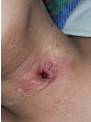
Figure 1. Picture of the patient's stoma while in the emergency room