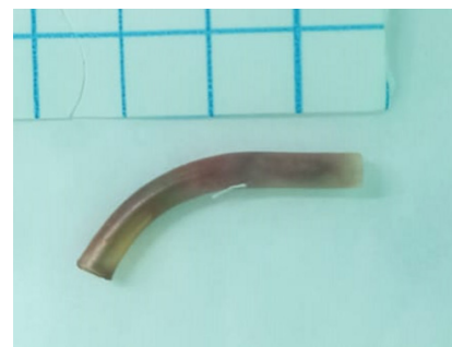
Figure 3. The extracted fractured tracheal cannula

After the operation, the patient was confined in the ICU and then, transferred to a regular ward after his condition had stabilized. Antibiotic, mucolytic, analgesic, and nebulization were administered during the treatment. After improvement of general condition and symptoms, the patient was discharged from the hospital on the 7 th day after the procedure. Education regarding the supervision, follow up and post-tracheostomy care was given to the parents.