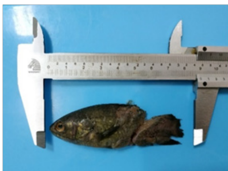
Figure 2. Foreign body a fish after extraction

Patient was suggested to control to ORL-HNS outpatient clinic Dr. M. Djamil Hospital Padang a week later but did not come. We did a follow up via telephone 2 weeks after the incident there were no pain while swallowing, choking while eating and drinking, coughing or hoarseness.