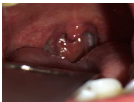
Figure 3. Oropharyngeal examination 1 st day after surgery