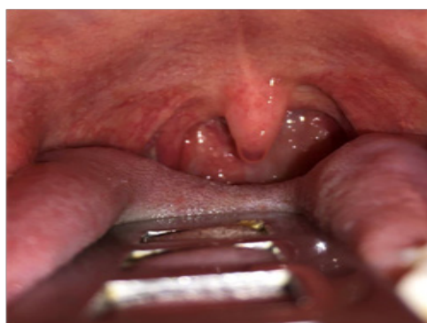
Figure 4. Oropharyngeal examination 4 th day after surgery