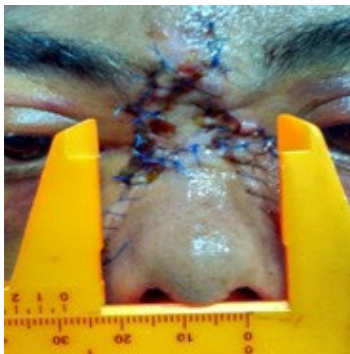
Picture 4. Intercanthal distance post reconstruction

On September 25, 2017, one month post operatively, the patient complained of blocked nose and decreased sense of smell, and upon examination it was found a swelling of the outer nose, and slight deformity. The medial alignment of the nose was good.