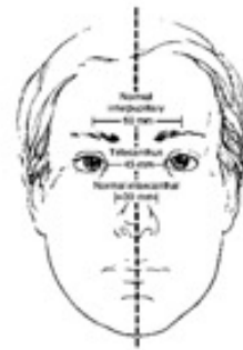
Picture 5. Normal intercanthal distance is 30 to 35 mm. 9

In order to avoid posttraumatic telecanthus by fixating the medial canthus, the wound was stitched using PDS 4.0 thread from left medial canthus to nasal region.