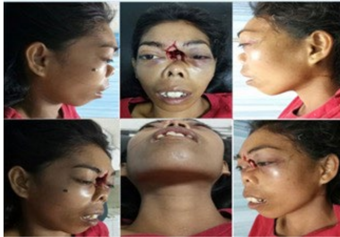
Picture 1. Patient's face after the accident

fractures. She was given Cendo Lyteers and Chloramphenicol eye drops.