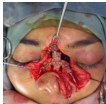
Picture 3. Durante surgery